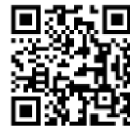
Confirmation Volunteer Form