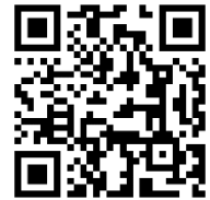
Confirmation Volunteer Form