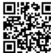
Confirmation Worship Notes Form