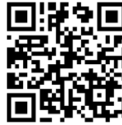
Confirmation Worship Notes Form