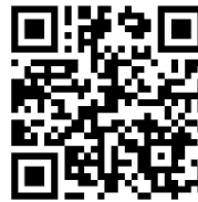
Confirmation Worship Notes Form