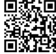
Confirmation Volunteer Form