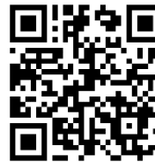
Confirmation Worship Notes Form