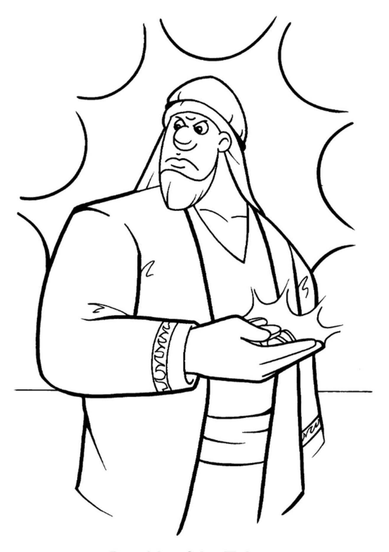
Parable of the Talents