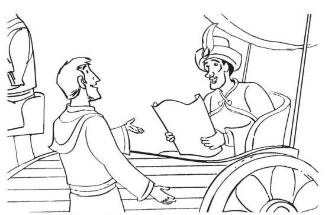
Philip told about Jesus. Acts 8:35

Ethiopian Wealthy Belonging Baptized Suffering Vocation