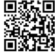
Confirmation Volunteer Form