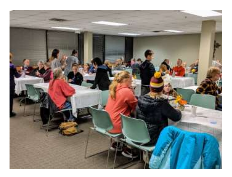
Dinner Church - Coming this Lenten Season on Wednesdays @ 6pm

8:15 am Traditional Worship 9:20 am Fellowship Hour and LiFT! Family Sunday School 10:30 am Contemporary Worship