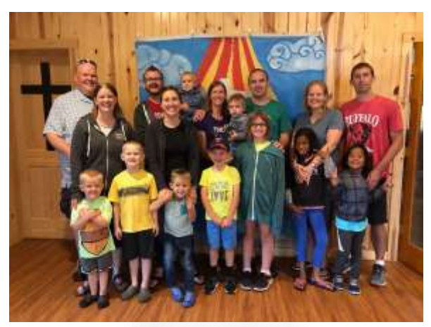
Luther Crest Family Camp

team. It was a delight to watch the leaders take charge and run with the program and share the joy of the holiday season. The reality is that these things couldn't have been done without a supportive congregation and community! Thank you for supporting this program.