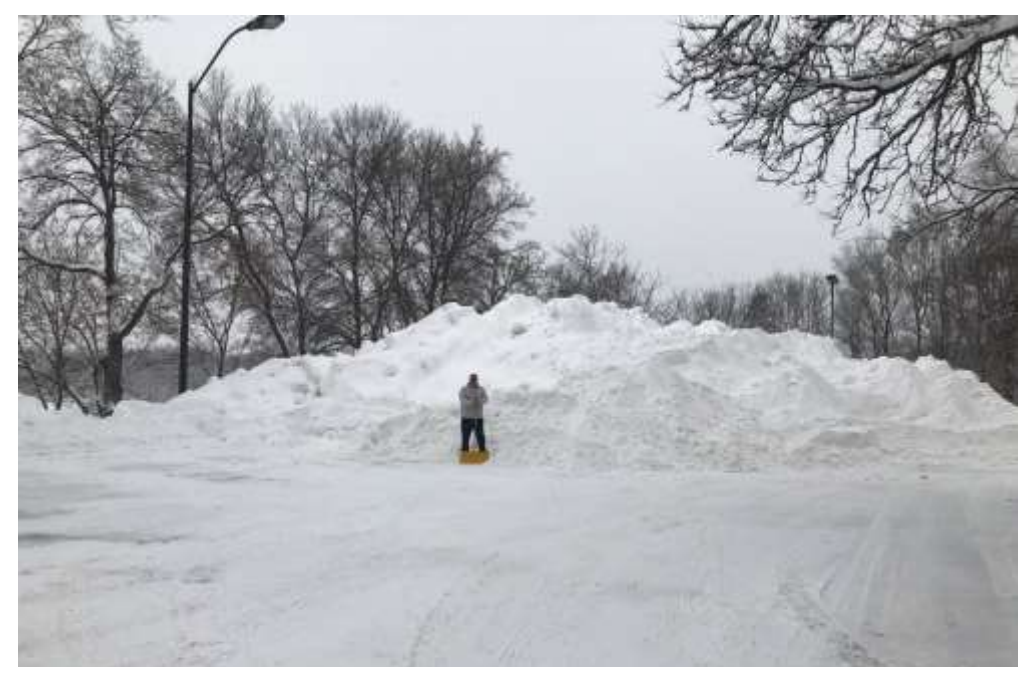
Remembering some of the snow that greeted us the beginning of 2019

The use of the building keeps growing which is fantastic but also means more wear and tear and upkeep. This group is happy to do what we do and asks for your continued support and input.