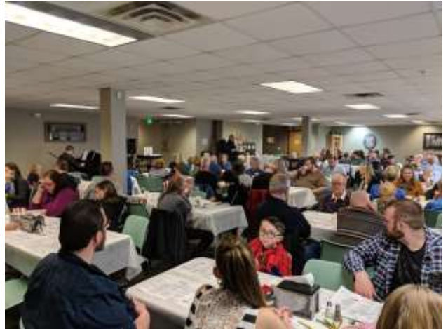
Last in person service March 11, 2020 Dinner Church