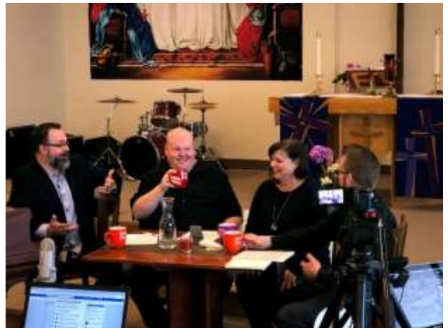
First online service March 15, 2020 Sunday Online Worship