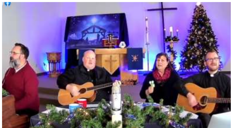
Christmas Eve Worship Service Online