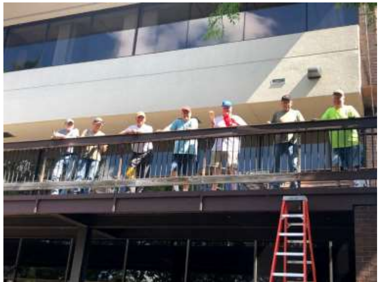
One of the few opportunities to have a crew assist with maintenance – deck painting this summer.