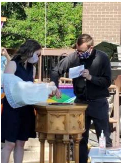
Baptisms during outdoor Drive-In Worship