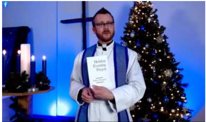
Evening Vespers – Holden Evening Prayer Service Held Sundays through Advent