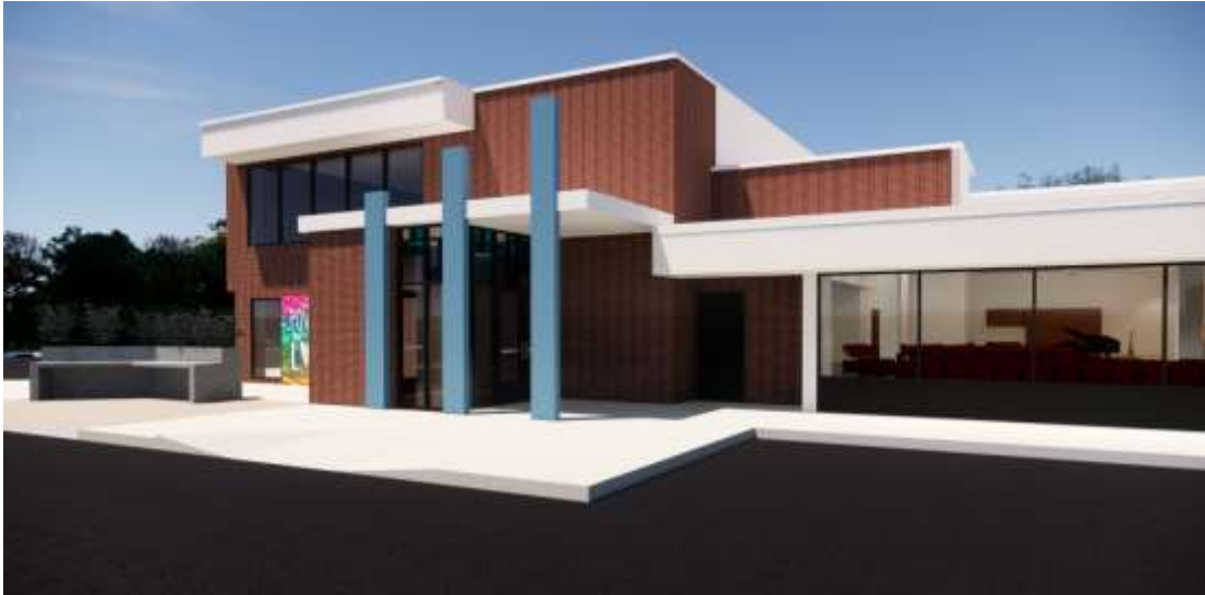
Above: Reduced exterior entry concept as a way to maximize project funds

Moving forward, the building committee is planning to have future forums to discuss the construction proposal and options, beginning in February. Be sure to look for a confirmed date in the upcoming announcements, as this will give you an opportunity to take in the work that has been done and to share feedback on the project moving forward. With much anticipation, construction will most likely start in the Fall of 2022.