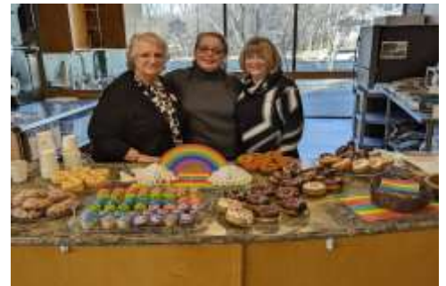
RIC Sunday 2024