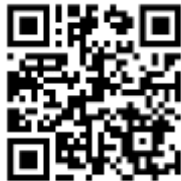
Confirmation Worship Notes Form